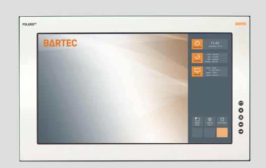
POLARIS Remote ZeroClient 24'' W