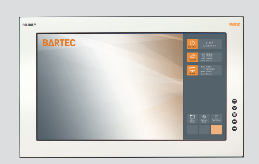
POLARIS Remote ZeroClient 24'' W