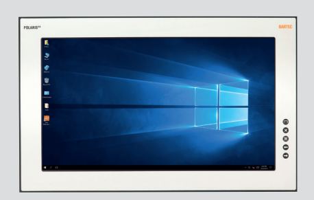
POLARIS Professional 24" W