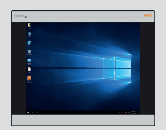
POLARIS Professional 19.1"