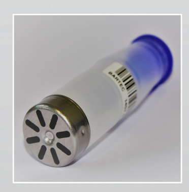
Barcode/RFID coded sampling bottle