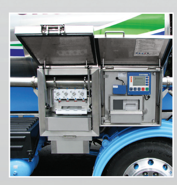
Ultrasampler, 4-way sampling capacity