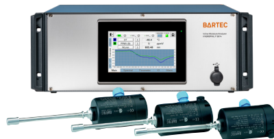
Trace moisture analyzers