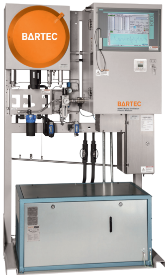
Process analysis solutions